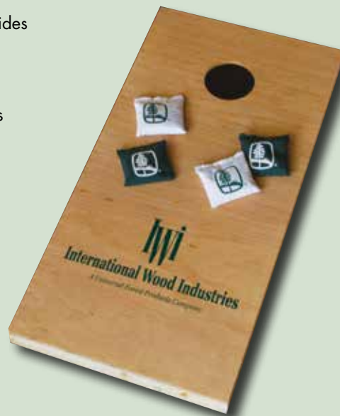
Custom graphics, bags and more